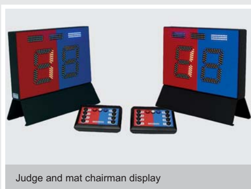
Judge and mat chairman display