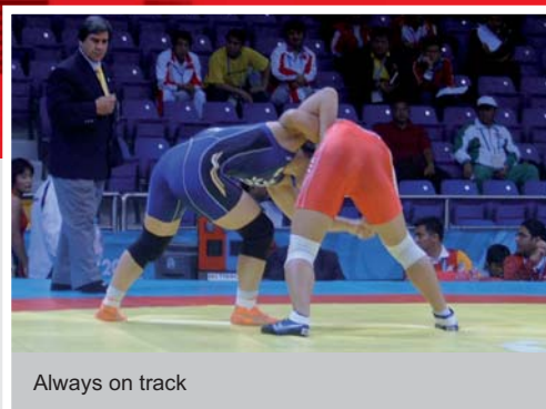
Always on track